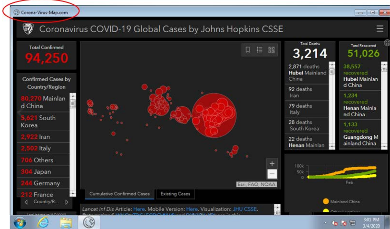
Figure 1. Screenshot of the malicious website "Corona-Virus-Map[dot]com" pretending to be a legitimate COVID-19 tracker.